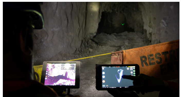
Remote inspections using Hovermap keep Kidd Operations personnel away from hazards.