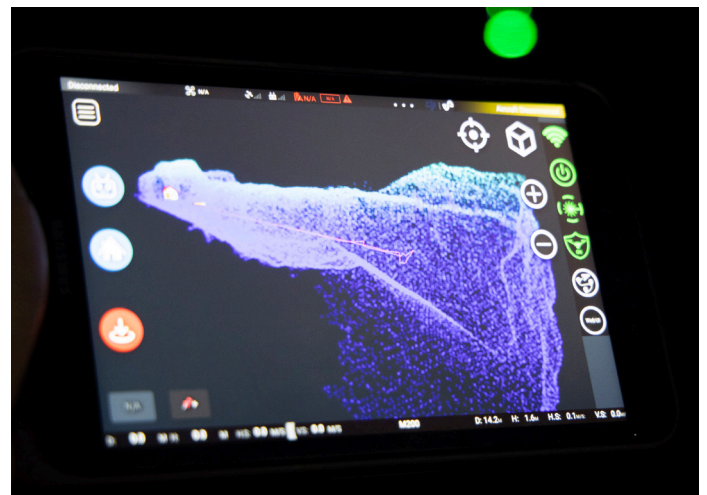
Hovermap transmits a 3D point cloud of the environment back to the operator in real-time, ensuring all areas of interest are captured in the stope.